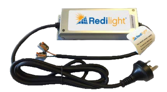
Low Voltage Power Supply