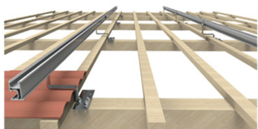
Tile roof bracket